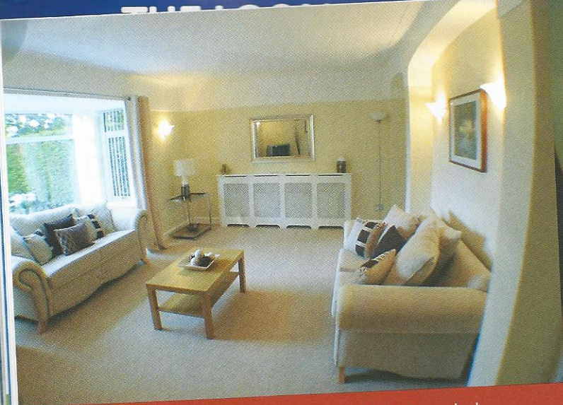
LOVELY LOUNGE – Relaxing tones, muted shades, a lack of clutter and plenty of light can be the hallmark of your new lounge when you downsize.